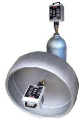
Shut off valve with Vacuum Regulator Remotely Mounted