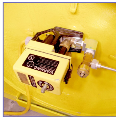
IV-830 with emergency shutoff actuator on a ton container with flexible connector.