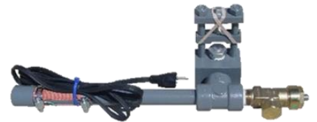
Universal Ton Adapter TUY-1