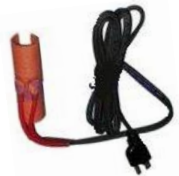
Drip Leg Heater HTH-111-500