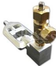
Isolation Valve Assembly IV-830