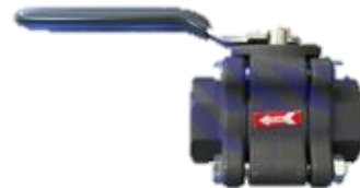
Chlorine Ball Valve Model CBV

Two adjustable relay contact switches. Low pressure and high pressure alarm.