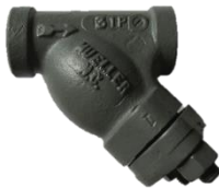
Chlorine Manifold Y-Strainer RH-6786

Used to help remove impurities in chlorine gas