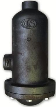
Gas Filter Model C-282

Used to remove impurities in chlorine gas. Recommended for use on any installation using one ton chlorine cylinders