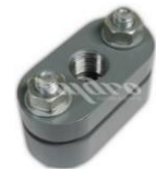
Manifold Union AH-1461