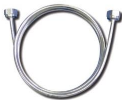
Flex Connector Model FX