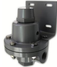
Pressure Reducing Valve PRV-71H

Used to reduce and control the gas feed pressure downstream of the valve