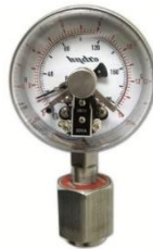
Pressure Gauge PGS-14-EW

Two adjustable relay contact switches. Low pressure and high pressure alarm.